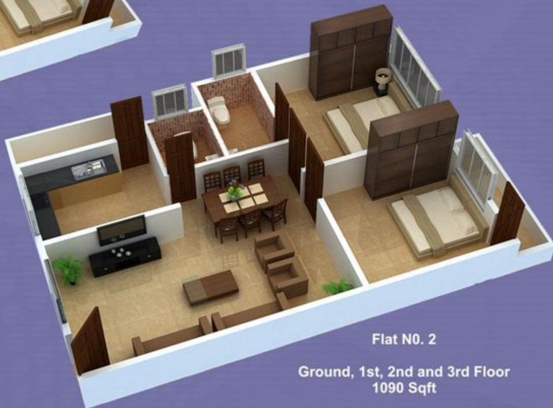
Flat NO. 2

Ground, 1st, 2nd and 3rd Floor 1090 Sqft