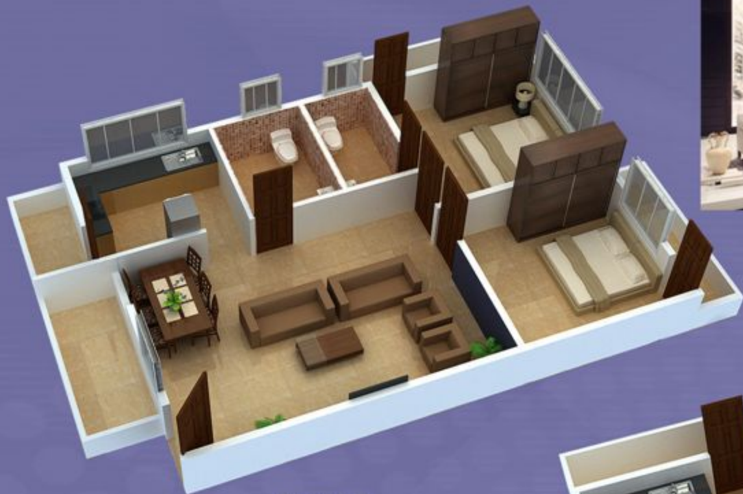
Flat NO. 1

Ground, 1st, 2nd and 3rd Floor 1130 Sqft