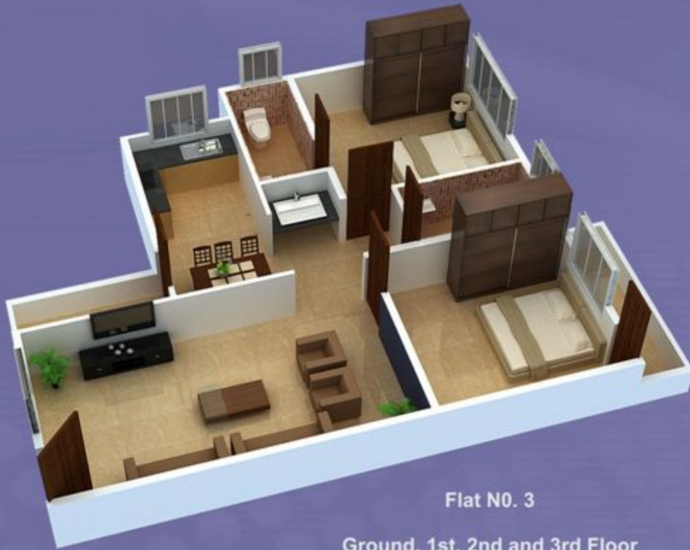
Flat NO. 3

Ground, 1st, 2nd and 3rd Floor 1150 Sqft