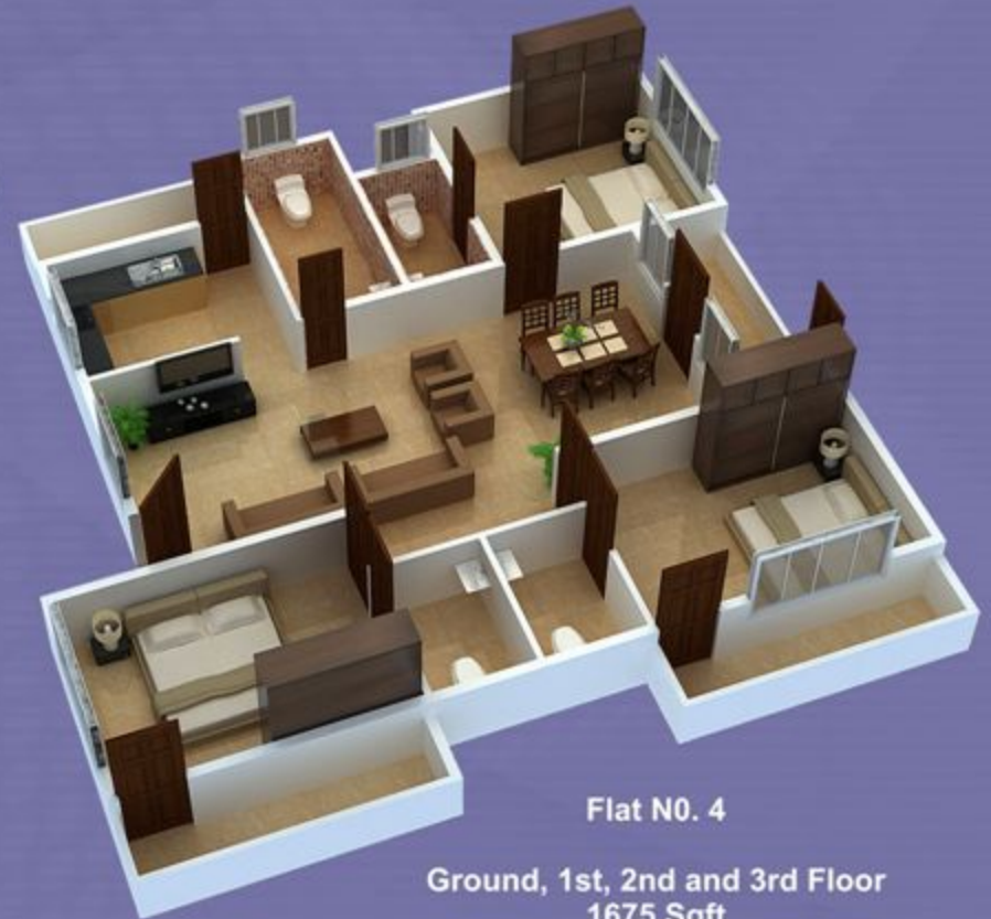
Flat NO. 4

Ground, 1st, 2nd and 3rd Floor 1150 Sqft